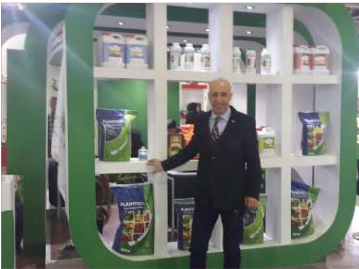
Isfahan Agricultural Fair 2015