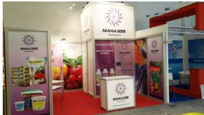
FRUIT LOGISTICA FAIR BERLIN 2015