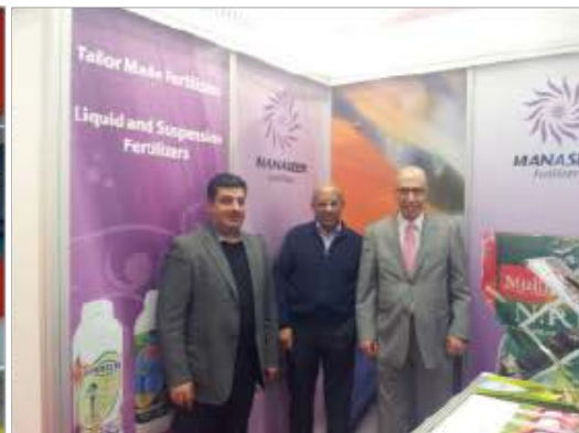
IPM ESSEN Germany 2012