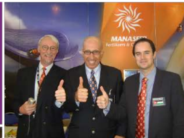
Hortifair Netherlands 2011